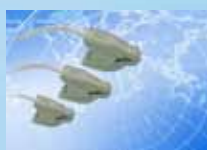
Single Patient Disposable