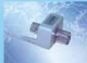
Mainstream CO 2