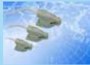
Single Patient Disposable