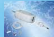
Sidestream CO 2